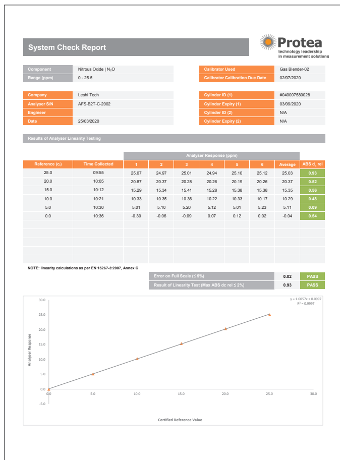
Calibration workbook provided with atmosCAL gives EN and ISO calculations for the user

With each atmosCAL, Protea will provide a calibration workbook (Microsoft Excel format) that can be used with the data from atmosCAL and the gas analyser to provide a calibration certificate for the analyser over its range.