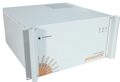
Figure 2 - atmosFIR FTIR analyser – High Resolution and 19" rack ready for installation.

By using the atmosFIR gas analyser platform based on FTIR spectroscopy, Protea can speciate complex mixtures of hundreds of VOCs quickly and accurately. As an example, Fig. 1 lists 25+ components from an engine emission application, where Protea provided a system that would qualify and quantify using atmosFIR.